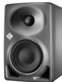
The Neumann KH 80 DSP

The first step in the partnership has been to install and calibrate the 9.1 loudspeaker system in the standard 6-metre Igloo Shared VR cylinder. The resulting AMBEO Igloo cylinder works with an acoustically transparent screen that lets the high-quality audio pass unhindered, allowing for full immersion in both audio and video.