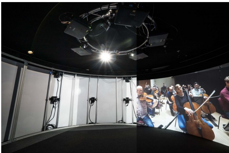
The Neumann KH 80 DSP loudspeakers are set up in a 9.1 arrangement behind the acoustically transparent screen of the Igloo cylinder, fully enveloping visitors in the orchestra sound

The environments act like a giant VR headset: Wraparound sound and vision immerse entire teams in 360° or VR content. With Igloo spaces ranging in size from 5 to 21 metres in diameter, up to 750 people can join the experience and be engaged, inspired or entertained. Adding the Sennheiser AMBEO 9.1 system means that true 3D spatial soundscapes can be reproduced, enabling sound designers to precisely pinpoint the locations and sources of different sounds, accurately linking what is seen with what is heard.